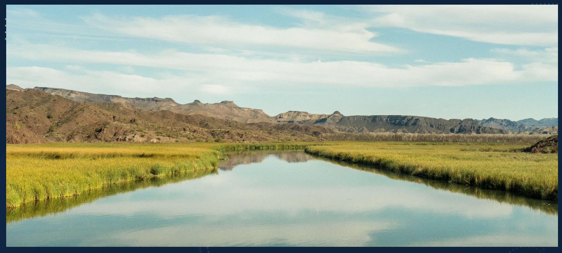
Colorado River in Mohave County | October 2022